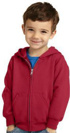
Kid Options Too!